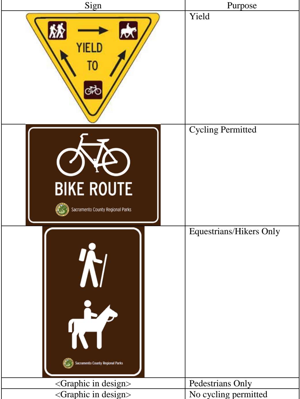
Table 2: Sign Examples

Other signs : The Parkway Manager will provide signage in other parts of the Parkway where the Parkway Manager determines trail use is causing environmental damage. These may include printed map signs which are suitable for insertion into existing kiosks anywhere on the Parkway or physical barrier signs to keep riders out of sensitive or non-approved trails. These signs shall inform potential users of the existence and location of the legal riding network, point out their current location, and state that riding anywhere else is unlawful. At present, signs prohibiting off-paved trail cycling signs are in place throughout the Parkway using Carsonite signs. Table 2 below shows examples of the type of signs that may be used for the pilot.