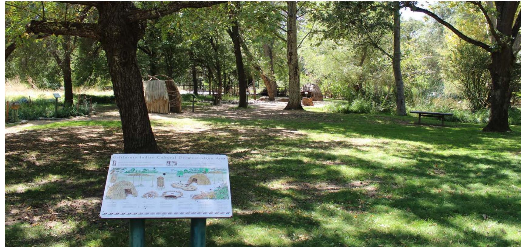
The California Indian Cultural Demonstration Area at the Effie Yeaw Center.