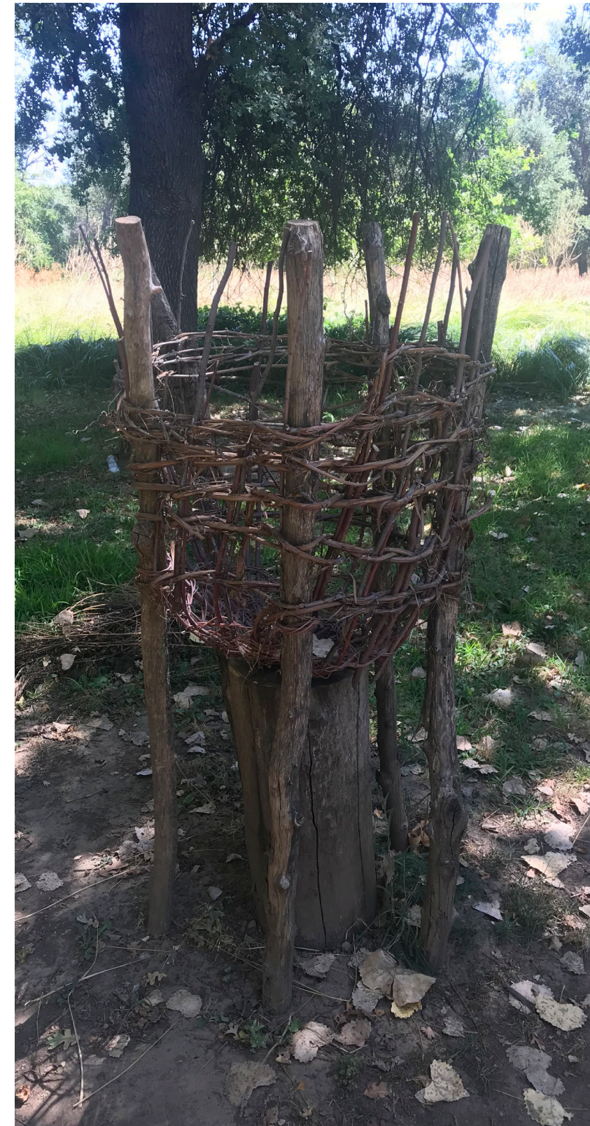
Acorn granary replica at the Effie Yeaw Nature Center.

historic structures or buildings. Of note is the Folsom Mining District, listed as a historic archaeological resource comprising multiple sub-sites (i.e., foci) within a large area. The CHRIS search identified 18 archaeological resources fully outside the Parkway, but located within 0.25-mile of the Parkway boundary (eight are prehistoric archaeological resources, three are combined prehistoric/historic archaeological sites, and seven are historic period archaeological resources). A historic landmark resource (Five Mile House) in the study was also included in the CHRIS search from the NCIC.