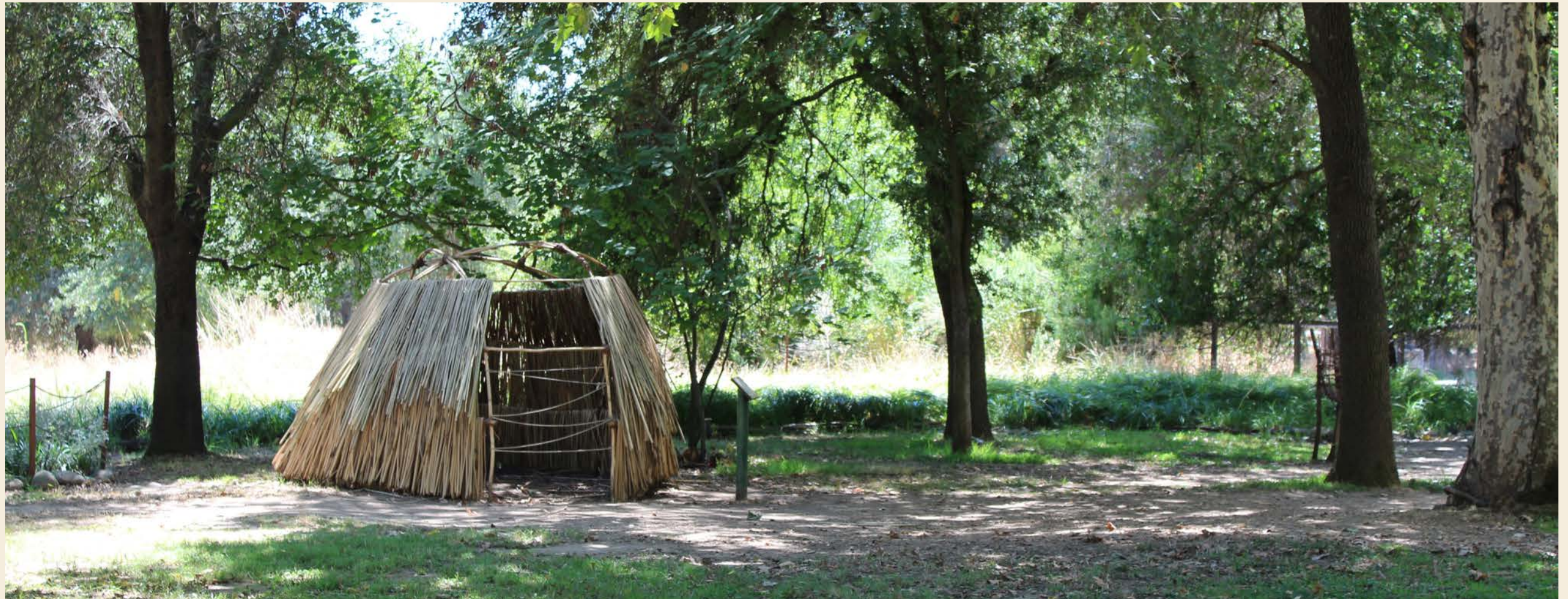
Tule hut replica at the Effie Yeaw Nature Center.

Gold rush activities in the Parkway were most rigorous between 1847 and 1859. Mine tailing and dredging remains characterize these resources, as well as remnant structures, foundations, walls, and placer mining materials. Industrial activities began in the Parkway in the mid-nineteenth century and related impacts continue to affect the Parkway today. Industrial resources include historic railroads, bridges, utilities, and major structures; as well as other historic period structures and residences that embody a past architectural style.