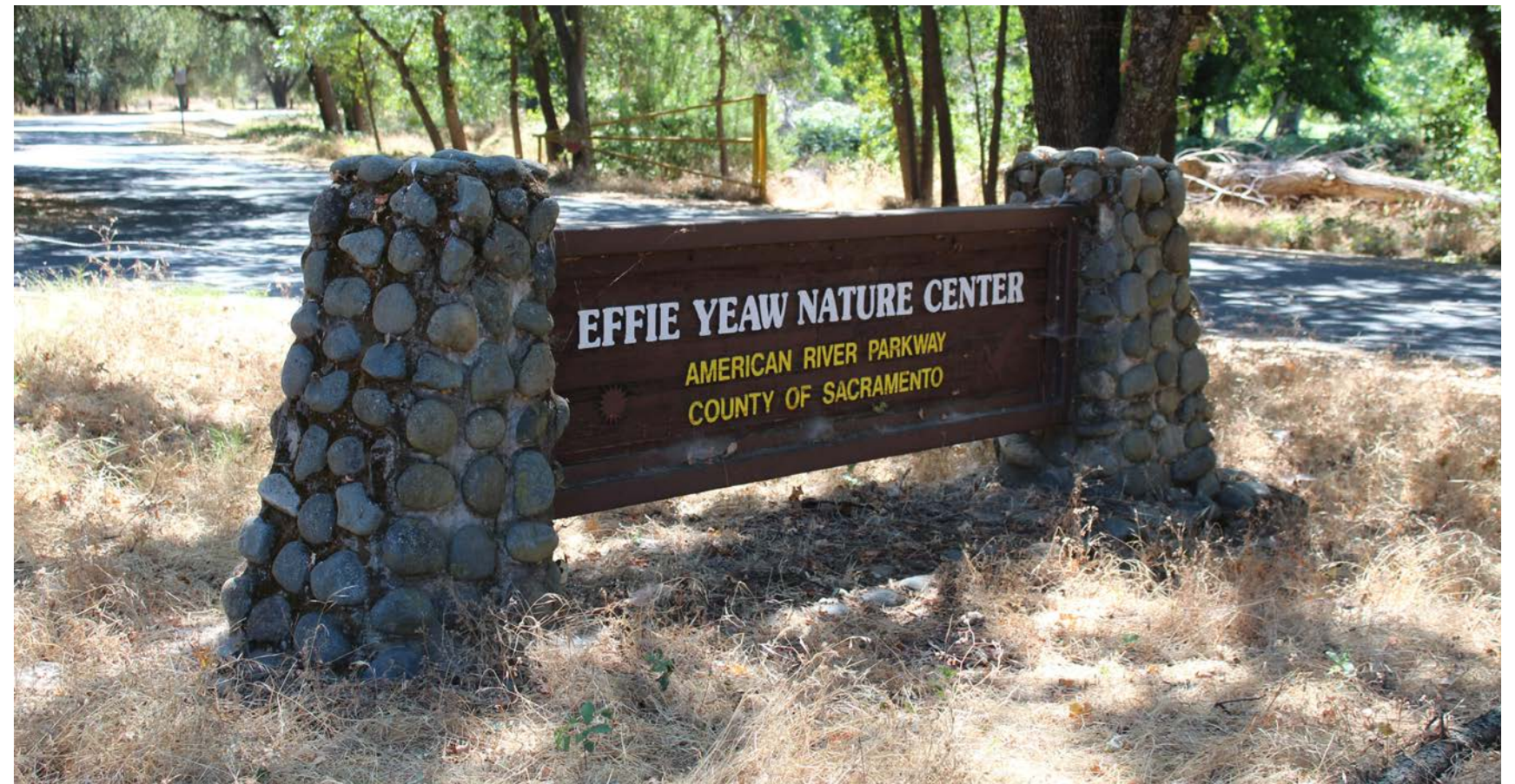
Entrance signage at the Effie Yeaw Nature Center.

Plans for a park along the American River date back to as early as 1915, when the Board of Directors submitted a plan to the City Commissioners of Sacramento for an extensive park system referred to as the “American River Parkway.” This plan was not instituted, but in 1929, the first state park bond act was passed. In 1949, the River Beautification Commission was created to plan and design development of recreational areas on the American River. The State Park Commission had set aside funds for acquisition of lands