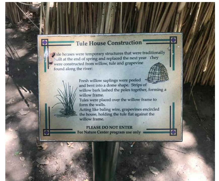
TOP Tule hut replica at the Effie Yeaw Nature Center. Photo Credit: MIG BOTTOM Interpretive tule hut placard at the Effie Yeaw Nature Center. Photo Credit: MIG